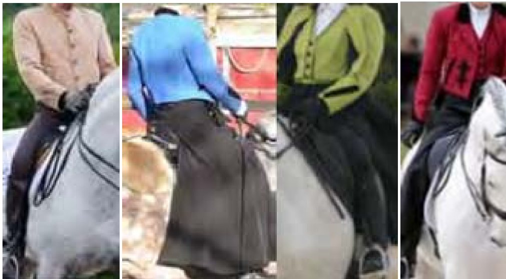
14 Points with classical boots and trousers