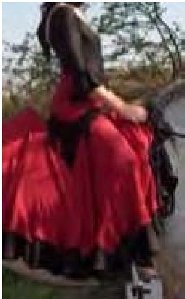
10 Points FOLK DRESS