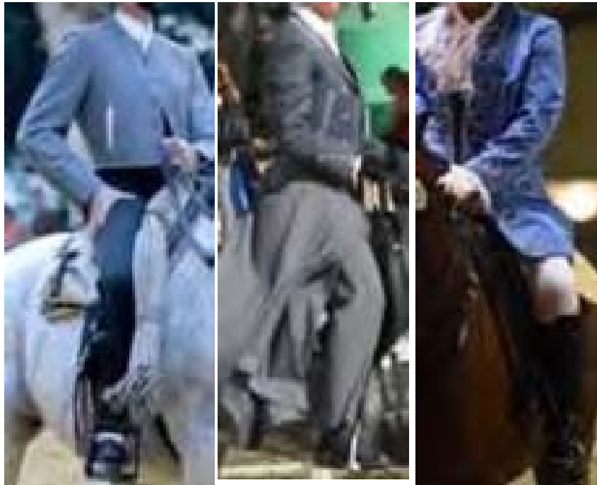
16 Points FULL DRESS