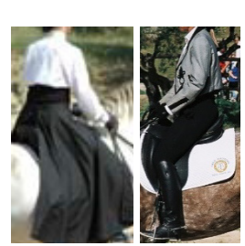
12 points PART DRESS